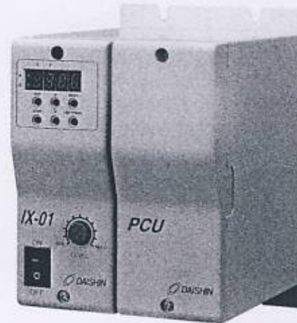
System Controller (Example)